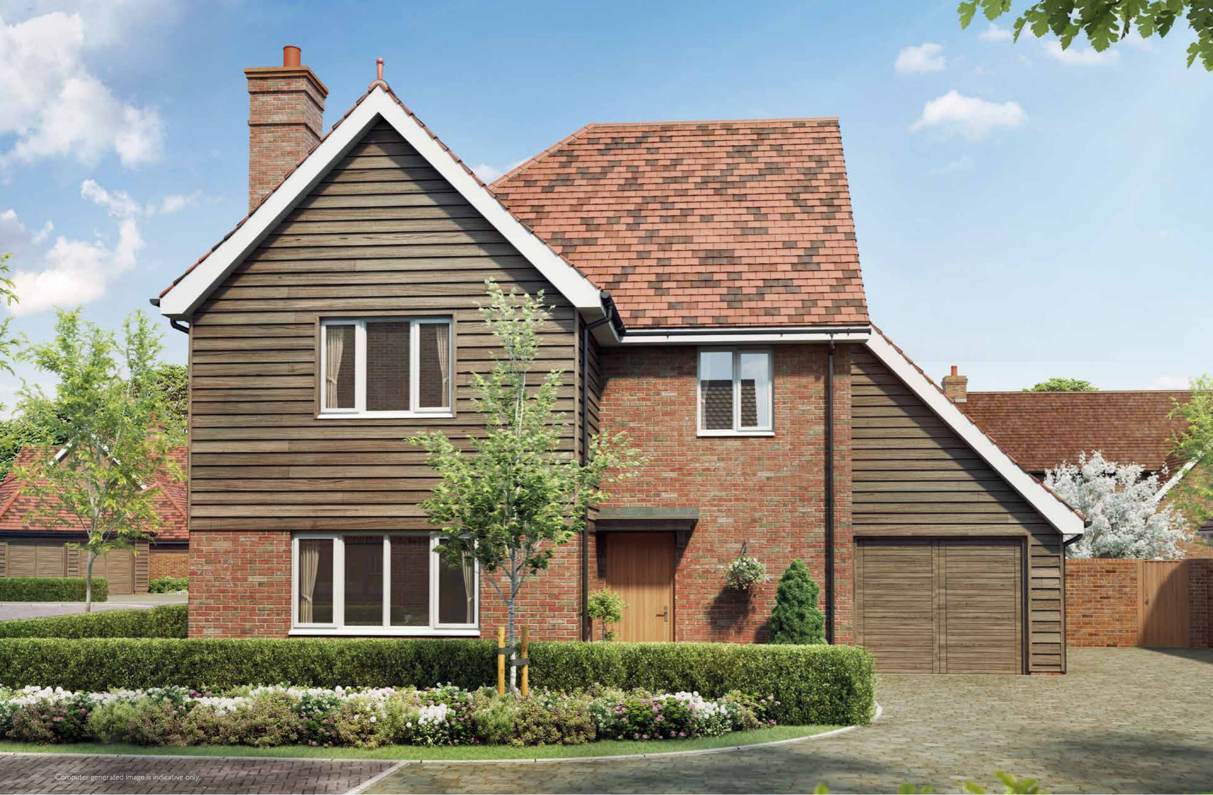
The Teasel 4 bedroom detached home 1896 sq ft